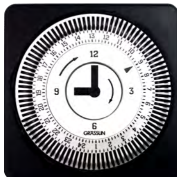
Actual timer may vary